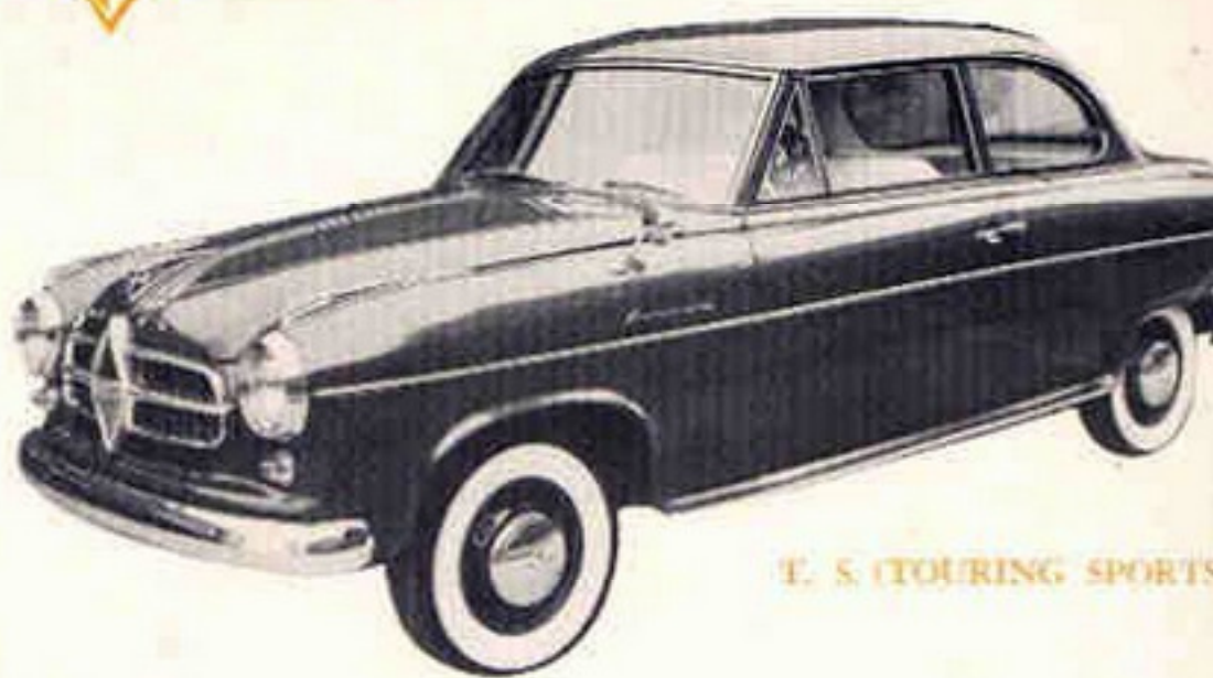
T. S. (TOURING SPORTS)

Boed on the racing circuits of Europe and the Mexican road races, the Isabella T. S. (Touring Sports) is the ultimate in high performance Sports Touring cars. Chassisless construction, advanced suspension, high power to weight ratio and clean aerodynamic lines give 102 m.p.h. and cruising speeds up to 190! Seating 6 comfortably and featuring aircraft type reclining seats, only the T. S. combines luxury with real sports car handling.—The T. S. is a prayer answered for the sports car enthusiast with a family. "A dream come true."