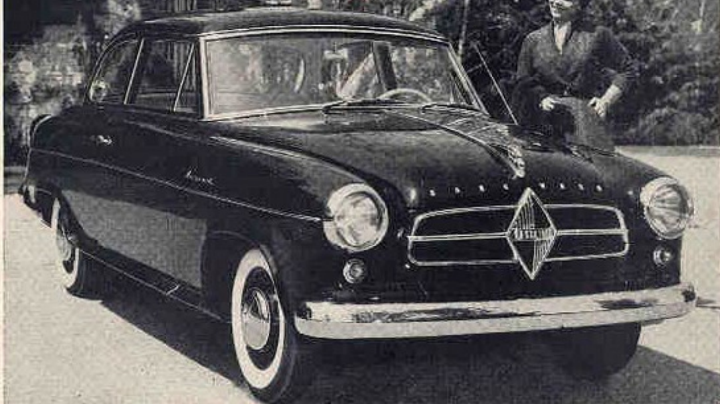
ISABELLA "1500" 6 passenger Sport Coupe

The all new beautiful Borgward "Isabella" 6 passenger Sport Coupe is Europe's finest engineered masterpiece in the economical Small Car Field. The Isabella has: